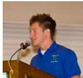
You are truly molding the future of our youth!

The skills that every active 4-H member is taught is exactly what allowed us to complete this year with success. We all have been faced with an experience