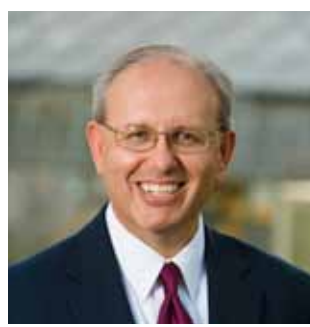
Take time to attend 4-H Camp open houses this summer.

The college has also been conducting a strategic planning study of the 4-H camping program. The planning committee has identified 5 major action areas: Leadership devel-