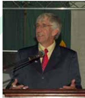
It has been my honor to serve on the Foundation Board for nearly 10 years!

As Chairman, what I am most proud of is our new awards funding. In recent years, when a 4-H'er represented Kentucky 4-H at a national event, they also received an invoice to pay for the trip. If one of our best represents Kentucky at National 4-H Congress, National 4-H Conference or Livestock Judging, we should provide much, but not all the financial resources to make the trip an honor, not a bill. We have initially started this change