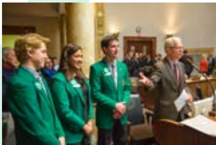
Senator Ernie Harris introduces the State 4-H Officers on the floor of the Senate Chamber. Senator Harris was State 4-H President in 1966.