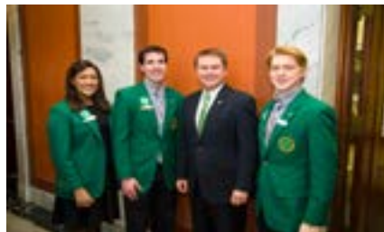
State 4-H Officers pause for a photo with Commissioner of Agriculture James Comer outside the House Chamber.