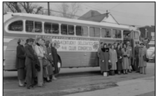
Thousands of 4-H'ers have attended state, regional and national events over the years. This photo is believed to have been taken in the 1940's, if you know the date or any of the people, please let us know.

information about Kentucky 4-H. We hope you enjoy this walk down memory lane and that it inspires you to reconnect with 4-H. If you have something you would like to share, please contact the Foundation.