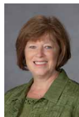
Thank you for your support!

Essential to developing and delivering a successful program are the learning activities, curriculum, educational material and