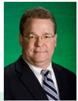
It is never too late to share your passion for 4-H by donating to 'Make the Best Better.'

A s I have traveled the state in recent months meeting with local 4-H leaders and presenting the “Looking to the Future” program, I have come to realize that I should take this opportunity to better explain the role the 4-H Foundation plays in Kentucky 4-H. Hopefully this will help you better understand who we are, what we do and how we do it.