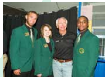
Governor Steve Beshear with 4-H officers at the state fair. The Governor serves as the Chairman of the KY Ag Development Board.

The 4-H Foundation will place nearly $125,000 of this grant in the endowment and use the balance to create an emergency fund that will allow the Foundation to continue support for the three new areas when the endowment proceeds are low.