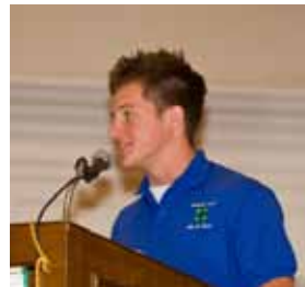
We are going to have a great year together!

The new Officer Teams first Council meeting of the year, we took a spin on a couple of activities. Instead of the out of the book "Ice Breakers" and "Team Building Activities" we taught everyone proper etiquette at a formal dinner