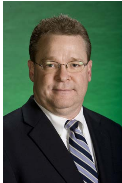
Thank you to all who help us Make the Best Better!

As a farmer, I loved to plow new ground. The smell of freshly turned soil is one I missed as no-till farming and technology changed how we planted crops. The Foundation has plowed a lot of new ground over the past four years, but beyond plowing you have to make time for planting and tending to the crop. This past fiscal year we have spent a great deal of effort in tending to our new crop. I am proud to report it has benefitted Kentucky 4-H very well.