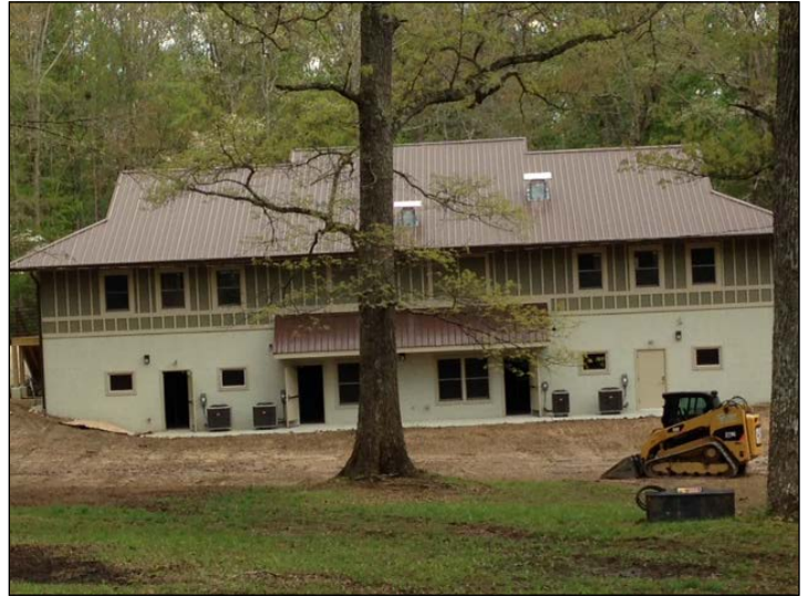
Rear view of the new cabin, shows the entrance to the storm shelter and class rooms.