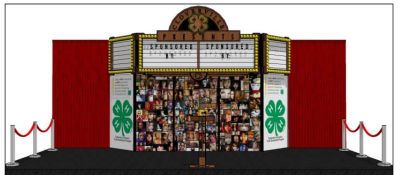
The Cloverville Stage.