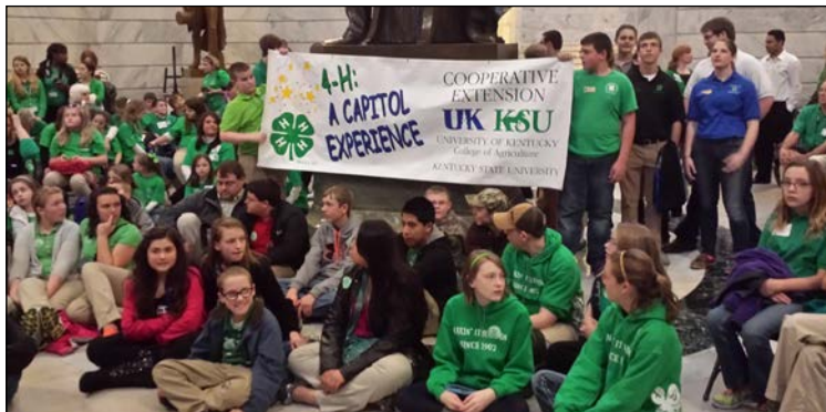
4-H members gather in the Capitol rotunda to hear from Kentucky government leaders.

Hundreds of Kentucky 4-H'ers participated in the 4-H: A Capitol Experience on March 19th in Frankfort. The program is sponsored by Kentucky's Touchstone Energy Cooperatives.