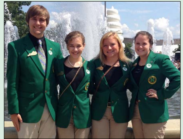
The 2013-14 State 4-H Officer Team.