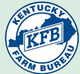
4-H State Teen Council and Officers are sponsored by Kentucky Farm Bureau.