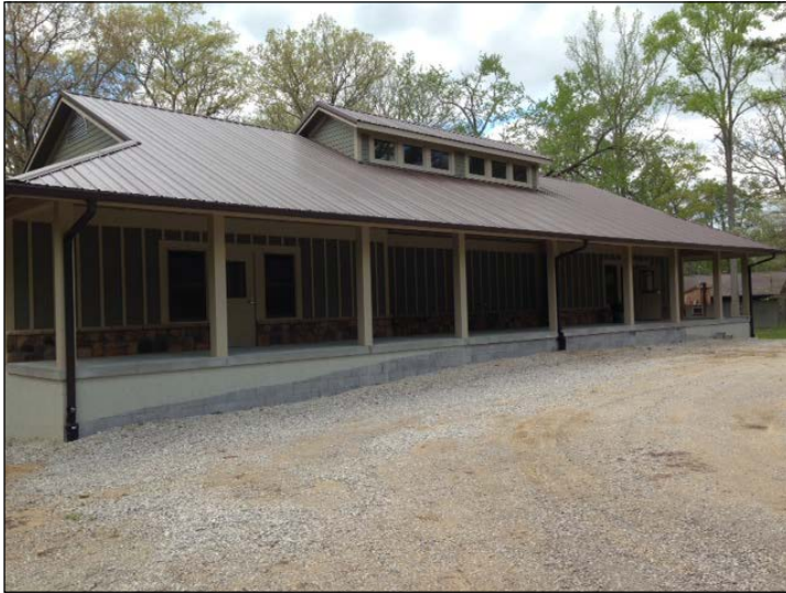
Front view of the new cabin under construction at the Feltner 4-H Camp.

Construction of the new cabin / storm shelter project at the J. M. Feltner Memorial 4-H Camp near London is coming along as you can see in these photos. Part 1 of the project will be completed before the summer camping program begins, that being the storm shelter and class rooms. Plans are in place to finish part 2 of the project later this summer. A ribbon cutting and grand opening is planned for this fall.