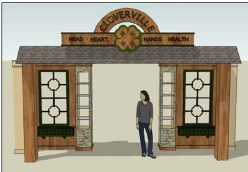
The main entrance to Cloverville.

Hopefully you are aware the 4-H Foundation, along with the 4-H Program has underway a campaign to replace the aging Cloverville. We continue to pursue our fund raising efforts which include eight major sponsor opportunities. And with the help of County 4-H Councils and 4-H Agents we kicked off the Every County for Cloverville campaign in March. Nevertheless, even with our success in both of these efforts, additional donations are needed.