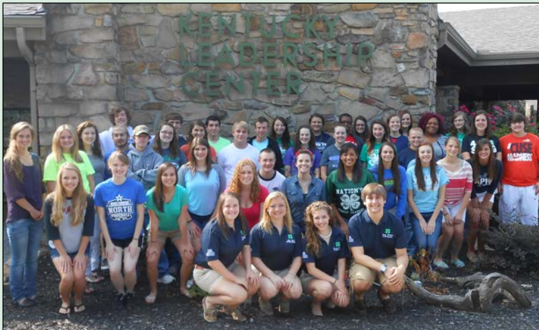
The 2013-14 Kentucky 4-H State Teen Council during their first meeting at the Kentucky Leadership Center.