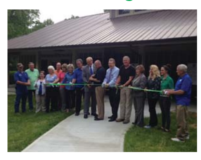
Ribbon cutting at Feltner 4-H Camp.

On May 14th members of the Kentucky 4-H Foundation, alumni, members and friends gathered to host a ribbon cutting of the new cabin and storm shelter complex at Feltner 4-H Camp. The project was launched three years ago and today Kentucky 4-Her's are enjoying this new addition to the campground.