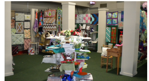
An example of the new display space in the Five and Dime store.

donations are welcome. Here's your chance to join hundreds of other 4-H supporters and honor your memories of 4-H and the time you spent as a 4-H'er at the Kentucky State Fair.