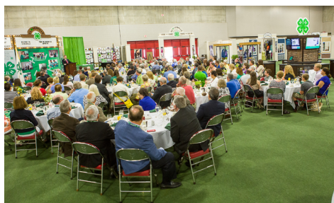
Nearly 160 guest enjoy breakfast in the new Cloverville during the Grand Opening and ribbon cutting.