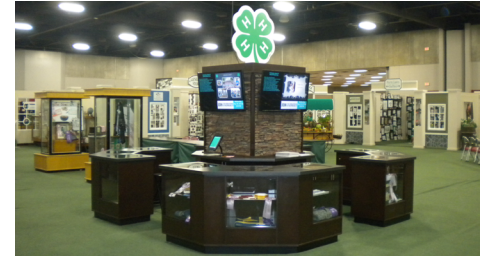
The new Welcome Center serves as both display space and information center for visitors to Cloverville.

The Foundation's fund development efforts will continue into 2015 as major sponsorships are still available and individual