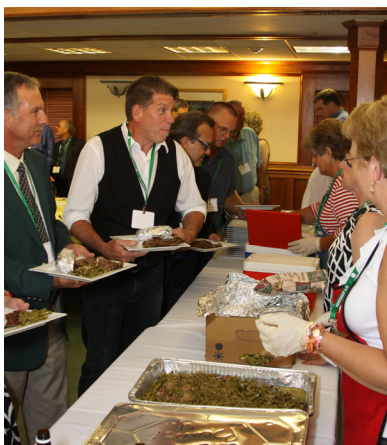
For the fourth year, the Kentucky Cattlemen Association provided one of their famous Ribeye steak meals.