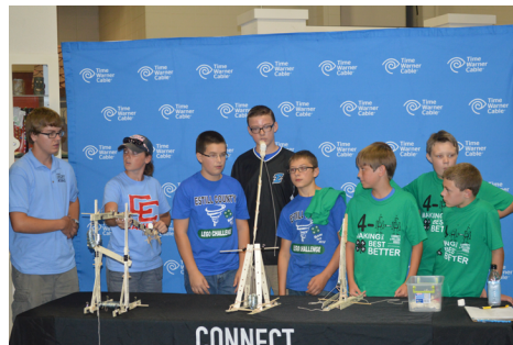
Three teams display their marshmallow catapults before the competition.

youth to build an understanding of basic science concepts; apply the processes of scientific inquiry; build skills in science, engineering and technology; explore related careers; and apply the skills and knowledge they are developing in new challenges.