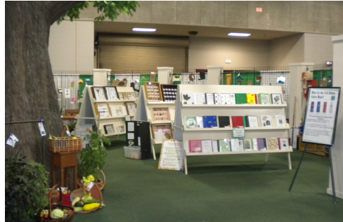
New exhibit space surrounds the tree in the new Cloverville Park.

thanks to our first four major sponsors, these being; Kentucky's Touchstone Energy Cooperative's sponsor of the General Store, Kentucky Farm Bureau sponsor of the Marketplace, Limestone Farm Lawn Worksite sponsor of the Farm, Lawn & Garden store, and the Kentucky 4-H Program sponsor of the Cloverville Stage.