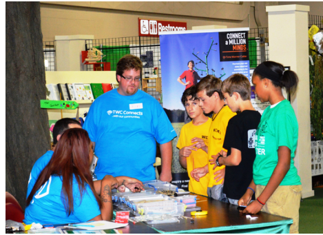
Participants visit the supply table to get the various items needed for the challenge.

Engaging youth in the 4-H SET (Science, Engineering & Technology) program has become one of the growing focuses of Kentucky 4-H. The Time Warner Cable Connect a Million Minds program is a natural partnership for Kentucky 4-H with like goals. The 4-H SET program encourages