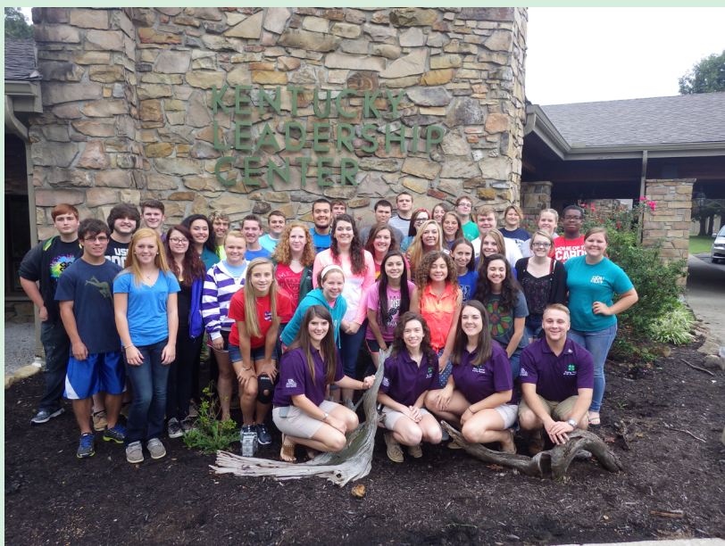
The 2014-15 Kentucky 4-H State Teen Council during their first meeting at the Kentucky Leadership Center.