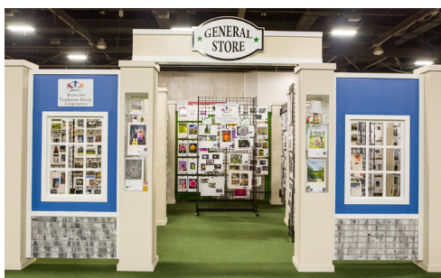
The General Store, sponsored by Kentucky's Touchstone Energy Cooperative's, long-time supporter of Kentucky 4-H and the first major sponsor to commit to the project.

Cloverville has been the face of Kentucky 4-H at the State Fair for nearly 40 years. Over the years, the old Cloverville had some facelifts, new paint and small modifications, however the main structure was the original from the 1970's and simply worn-out.