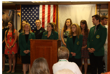
The State 4-H Officers and State Teen Council joined Homecoming to lead the pledges and introduce themselves.