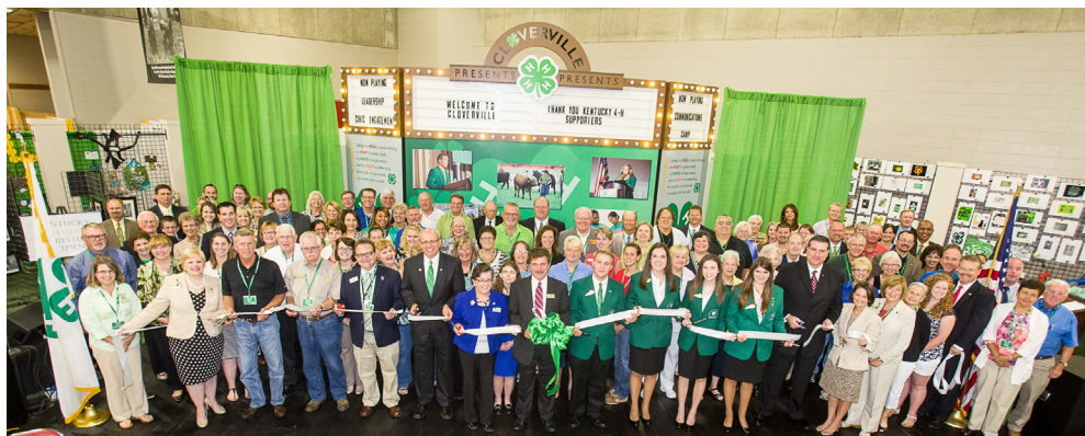
Supporters and VIP's gather on the new Cloverville Stage for a ribbon cutting on August 15.

Nearly 160 4-H supporters and VIP's joined the 4-H Foundation on August 15th for the Grand Opening and Ribbon Cutting for the all new Kentucky 4-H Cloverville at the Kentucky State Fair. The new exhibit is the result of more than a year of design, development, and fundraising efforts by the 4-H Foundation and State 4-H Staff.