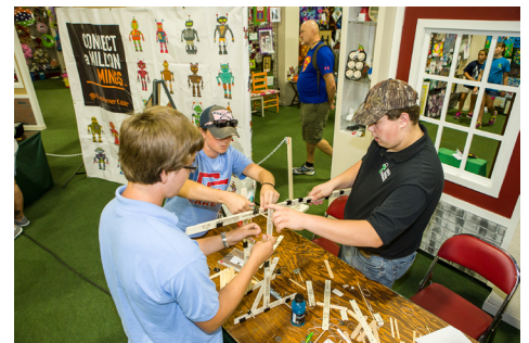
Team members building their marshmallow catapults.