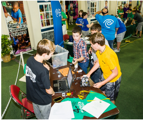
4-H members build their robot for the 4-H & Time Warner Cable Robotics Challenge.

The Kentucky 4-H Foundation welcomed a new donor this summer as Time Warner Cable became the sponsor of the Robotics Challenge held in the new Cloverville during the Kentucky State Fair. Thirty 4-H members participated in the first 4-H &