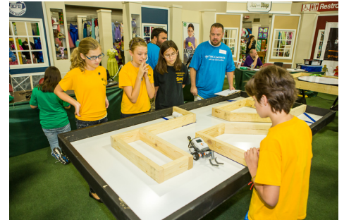
Team members watch their robot work its way through the robot maze.

Thanks to Time Warner Cable and its employees for sponsoring the Robotics Challenge and welcome to the Kentucky 4-H family.