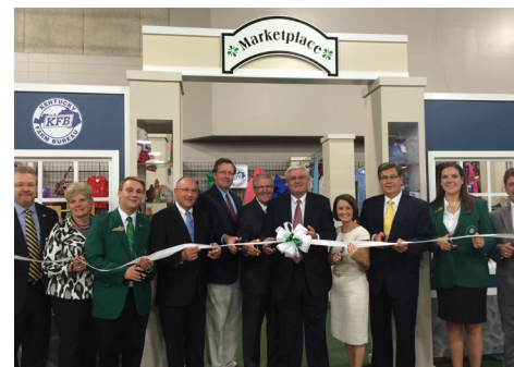
The Foundation hosted a ribbon cutting for the Marketplace store, sponsored by Kentucky Farm Bureau, here officials from KFB, the Foundation, and state 4-H officers celebrate the stores grand opening.

capacity and to allow for better viewing of 4-H projects. The new Cloverville stage carries forward the tradition of an old style movie theater marquee with signage and chasing lights, and is the location for many events during the State Fair. A new modern welcome center with four large screen TVs and two iPads help visitors learn about 4-H