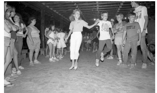
1984 Kentucky 4-H Celebrated its 75th Birthday. At that time 4-H received several grants to start the construction of the leadership center at Lake Cumberland. The Center opened in 1988.