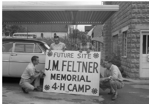
J.M. Feltner Camp was built in Johnson County, near Paintsville in 1933.