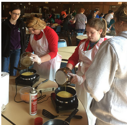
4-H Summit Delegates learn about food and nutrition while making their own omelet.