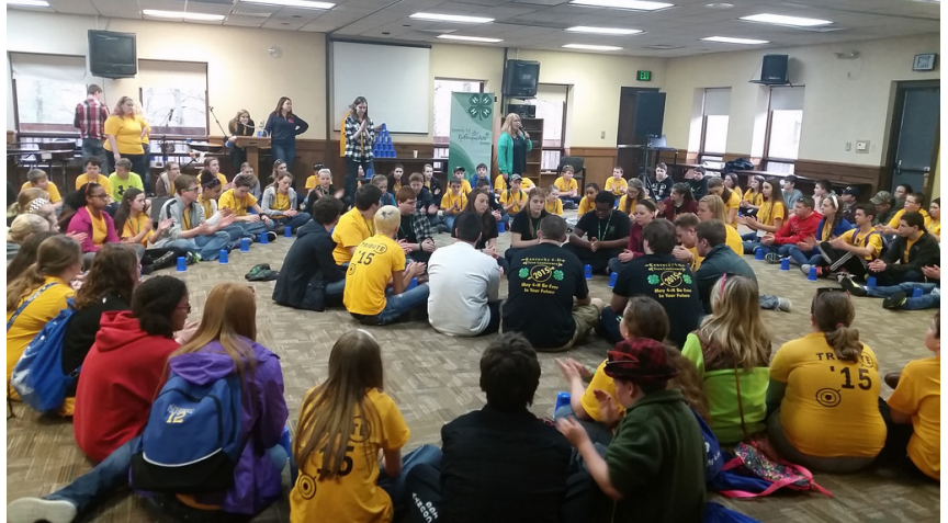
Members of the Kentucky 4-H Performing Arts Troupe present “How to Find Your Rhythm” to the 4-H Summit Delegates.

Each year 4-Hers are recognized for their achievements. The Kentucky 4-H program has an achievement based award program that begins with sixth grade through high school. Youth have a chance to earn “Clover Levels” through their participation in 4-H and competitively applying for the prestigious Bronze, Silver, Gold or Emerald awards when they are older high school students. During the 4-H Summit, youth are presented with their Clover Level 1, 2 and 3 awards.