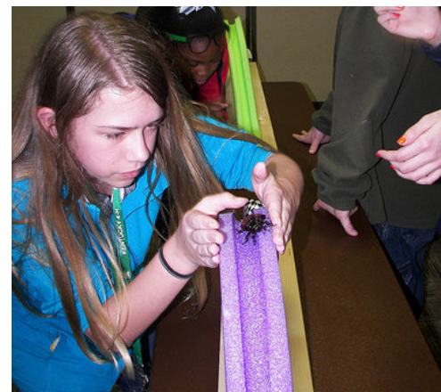
A 4-H Summit delegate races a Madagascar Hissing Cockroach while learning important science and natural resource principals.