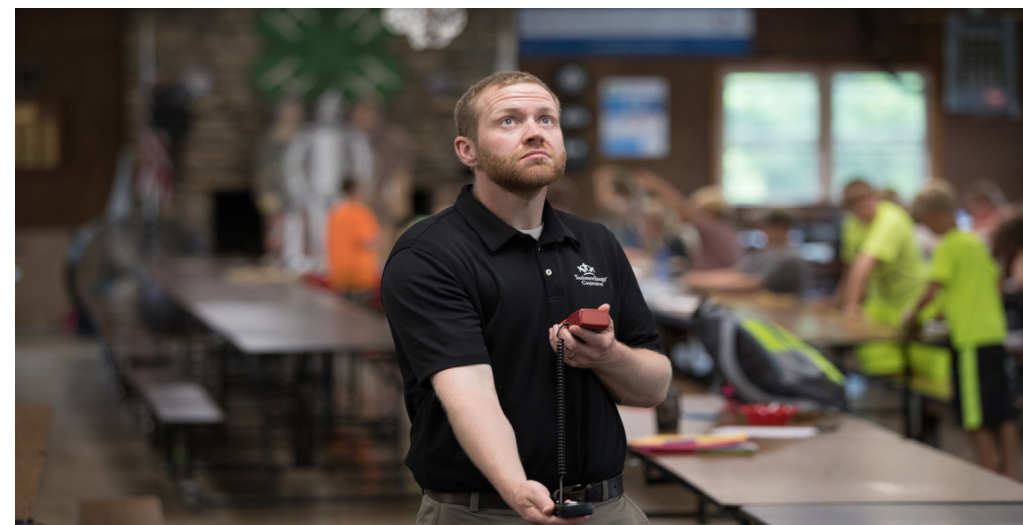
Castle testing light levels in the North Central Dining Hall