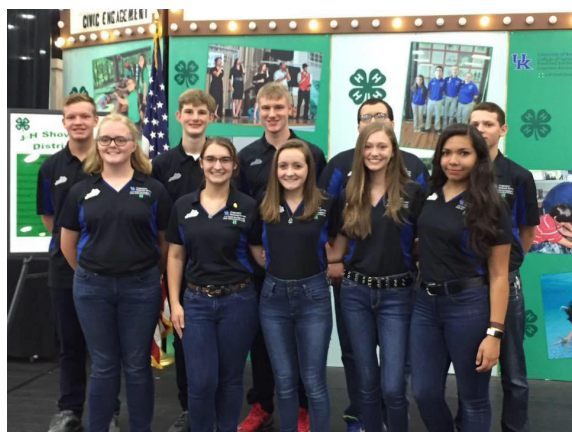
2018-2019 SET Leadership Board

Farm Credit Mid-America sponsors several 4-H programs including Teen Conference and National Congress trips – where their funding has had a tremendous impact on Kentucky youth. This year, Farm Credit Mid-America has expanded their support of Kentucky 4-H to include funding of the Science Engineering and Technology (SET) Leadership Board.