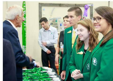
State Officers greeted guests