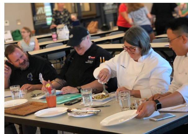
Culinary Challenge judges sample the finished dishes