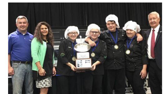
Montgomery County 4-H Culinary Team won the Junior Chef competition at the 2019 Kentucky State Fair

Montgomery County's 4-H Culinary Team also won this year's Junior Chef competition at the Kentucky State Fair.