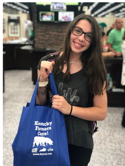
A 4-Her picks up her bag at Country Ham Project Day

Thank you to the Kentucky Soybean Board for continued support of Kentucky 4-H!