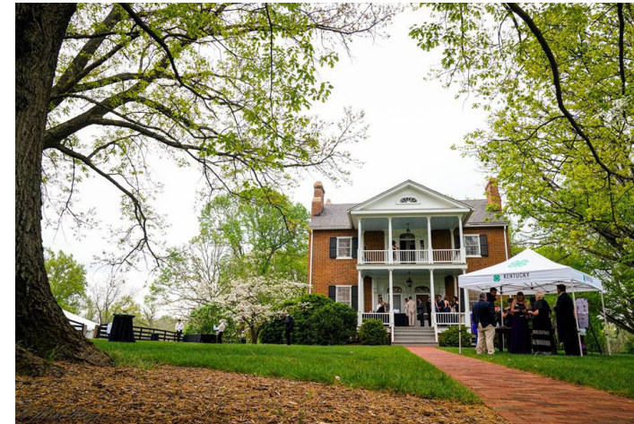
Hermitage Farm served as a picturesque setting for the second annual Emerald Gala