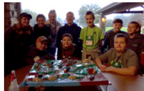
Academy Scholars pause for a photo at the fall retreat

The NRESci Academy The NRESci Academy is a three-year program designed to teach youth about their natural environment. In the program, scholars participate in hands-on investigations to learn about Kentucky's water, forest, entomology, and wildlife resources.