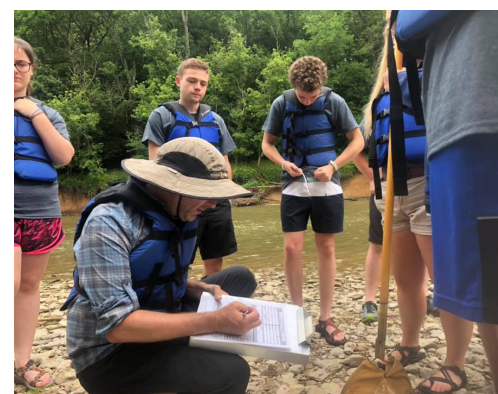
A group of teens explored Kentucky's biological aquatic resources as part of their "major" at the 2019 Kentucky 4-H Teen Conference.

Teen Conference was sponsored by the University of Kentucky College of Agriculture, Food, and Environment Cooperative Extension Service 4-H Program, the Kentucky 4-H Foundation, and Farm Credit Mid-America.