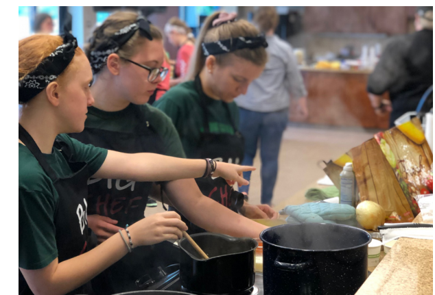
A culinary team works together on their dish