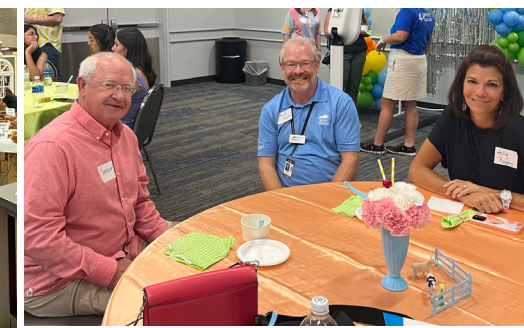
Pictured Top Center: Cloverville Stage Ribbon cutting ceremony for H&R Agri-Power at the 2023 Annual Appreciation Breakfast at the Kentucky State Fair